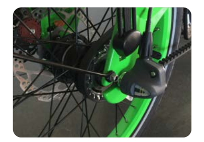
3 Speed Left Hand Grip Shifter