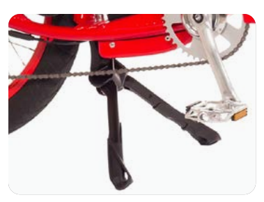
Motorcycle Style Stand

The "side stand" style kickstand has a single leg that flips out to one side and allows the bike to lean against it. The motorcycle style kickstand has two legs that are designed to expand as the kickstand is put in the down position and contract as it goes into the up position. Please do not sit on your Pedego with the kickstand in the down position.