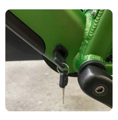
Key = Locked Position

Power for the bike and battery is controlled through the LCD screen located on the left side of the handlebar. To power on the bike, make sure the battery is fully inserted and locked, then press the power button on the LCD. To power down the bike, press and hold the power button for 2 seconds.