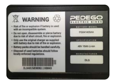
Label on Battery with Sleep Functions

If your Pedego battery has either of the labels pictured, then it is equipped with automatic sleep functionality. Reference the conditions and procedures below to understand when the battery will go to sleep and how to wake it back up.