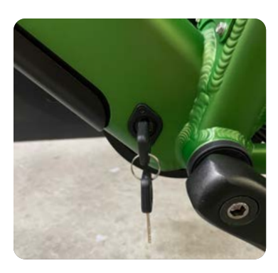
Key = Unlocked Postion

To remove the battery, insert the key and turn it counterclockwise until the bottom of the battery drops slightly. There is a secondary release lever located beneath the battery near the key; while holding the top of the battery with one hand, push or pull the secondary release lever while holding the bottom of the battery with the other hand, and carefully remove the battery from the bike. For the Avenue, push the secondary release lever towards the rear of the bike to remove the battery.