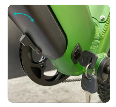
Secondary Release Lever